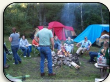
Campfire at Overnight Campout