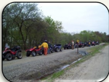
Ride the Downeast Sunrise Trail